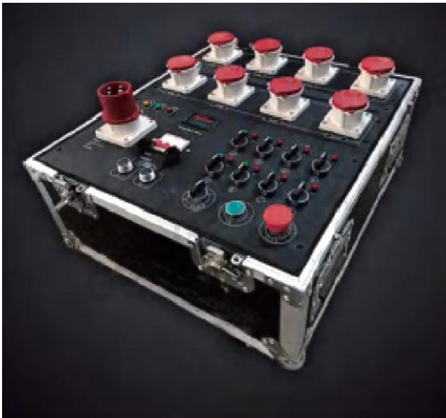
Flight Case Controller